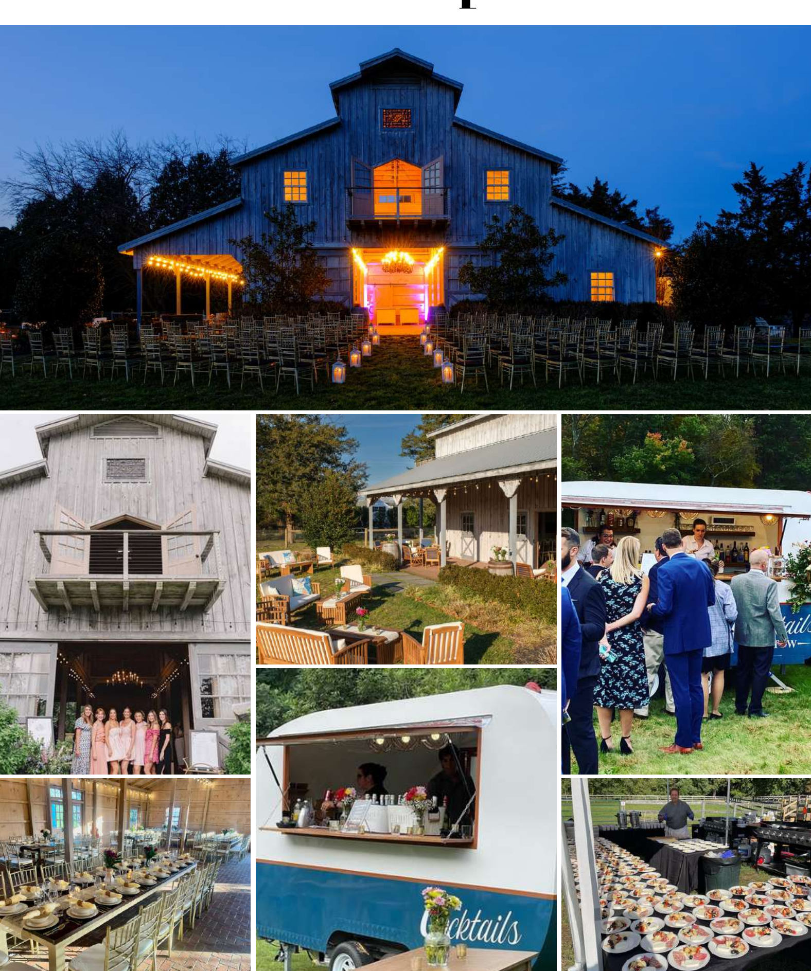
TAKE A MOMENT AND READ WHAT OUR CLIENTS HAVE TO SAY ABOUT US. <u>CLICK HERE.</u>